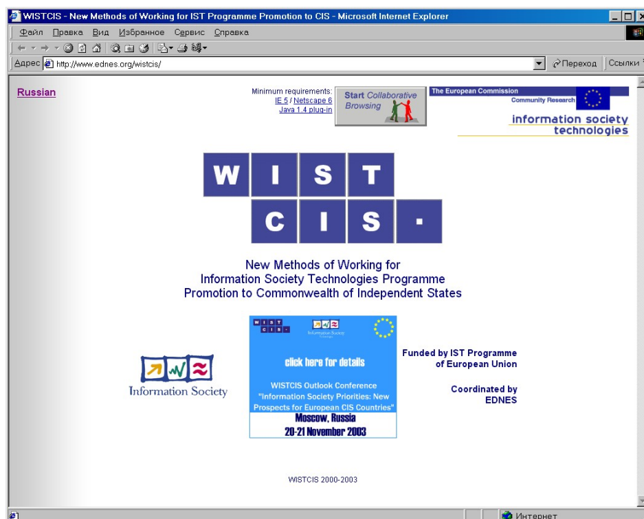
Figure 1. Moscow conference announcement at WISTCIS main Web-site (index Web-page)

The call for applications (Annex 1) to Moscow Outlook Conference contained information on venue, Programme Committee, Organising Committee, topics and sessions of the conference, audience, general schedule of the conference, submission of abstracts and registration procedures, deadlines, accommodations. The call for applications, as well as on-line registration form, information on exhibitions, social events and information for sponsors were installed at WISTCIS main Web-site ( http://www.ednes.org/wistcis/ , Fig. 1-3).